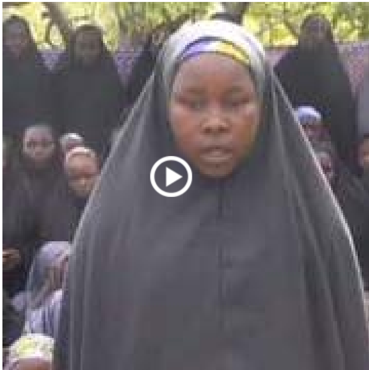
New Boko Haram video claims to show missing Nigerian schoolgirls clad in full-length hijabs