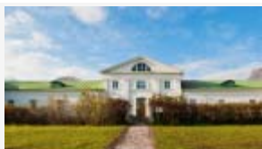
Must visit - Top 10 literary travel destinations