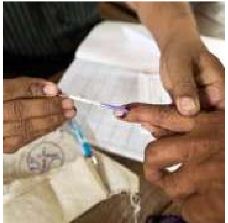
31% polling recorded in Bihar till noon