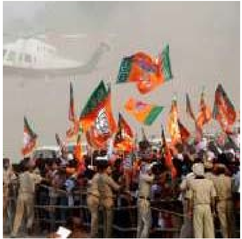
Election Commission releases BJP campaign material seized from its Varanasi office