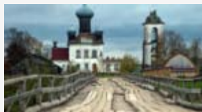
5 endangered tourist treasures