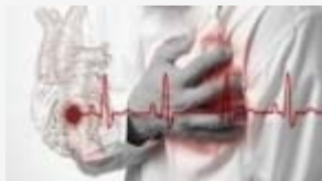
60% people at risk of a heart attack - Critical illness insurance