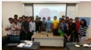
Get the skills you need to accelerate your career at MISB Bocconi