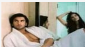
Actor Ranveer Singh says he carries a condom all the time