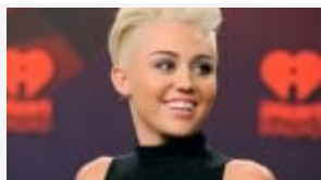
Miley Cyrus posts topless photo - Internet fails to react