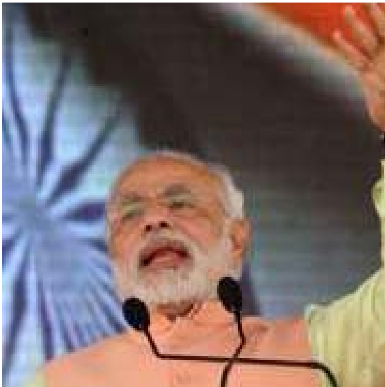
Narendra Modi appreciates voters for coming out to vote in large numbers