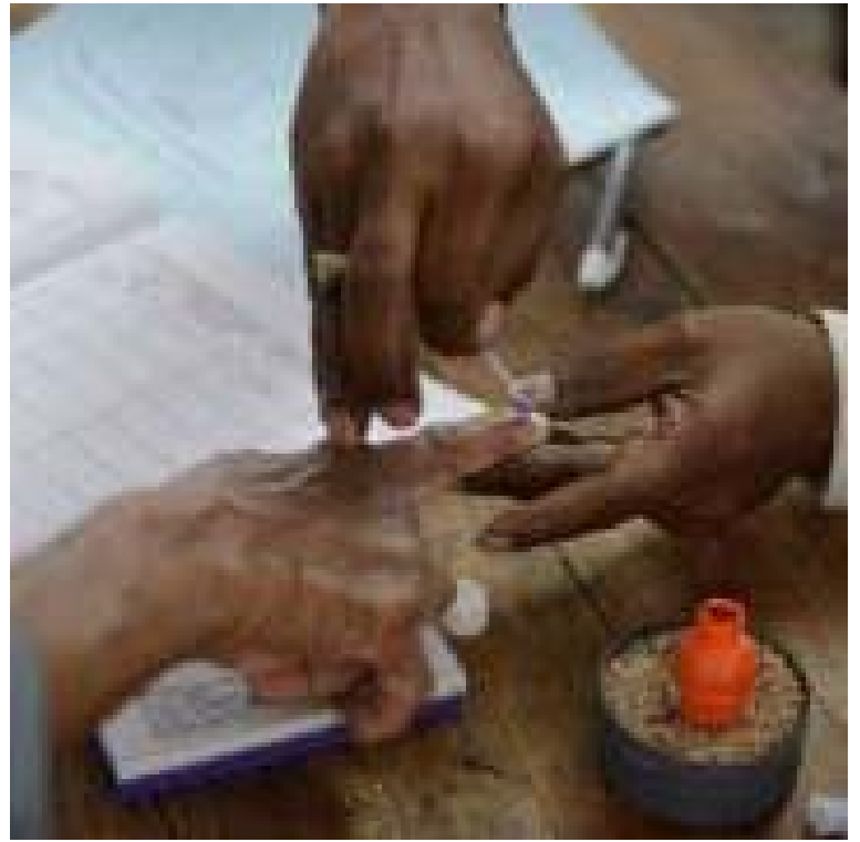
About 41% polling recorded in West Bengal till 12pm