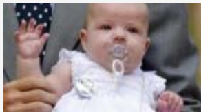
Youngest Criminal? - Infant arrested for attempt to murder