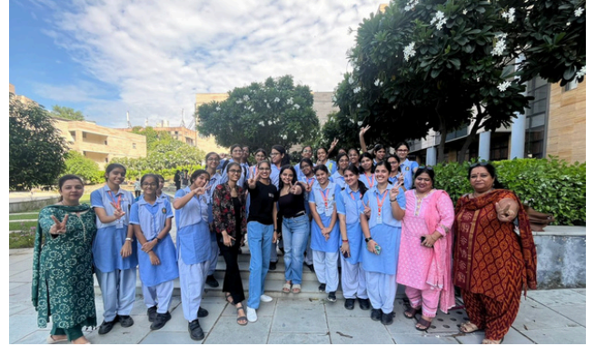
Lab Tour for High School Students

The camp empowered students to take a proactive approach to their well-being, encouraging them to understand their bodies better and make informed lifestyle choices. The camp was an excellent opportunity for students to prioritize their health in a convenient manner.