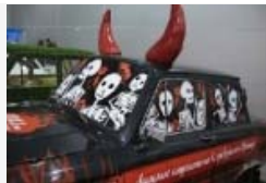
Exhibition of exotic new cars - Images