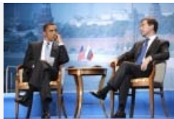
True relationship of Russia with America