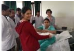
Cope with critical illness without financial worry