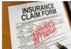
How to settle claim of your Insurance within 10 days